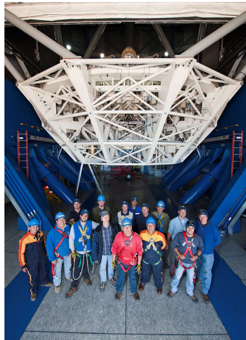
Group shot of engineers and maintenance staff at the VLT.

LSM appointed as an Emergency Coordinator at the observatories in the absence of the safety engineer during weekends or leave, are compensated under the same conditions as standby duty.