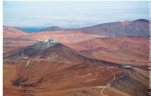
Aerial View of Paranal Observatory.