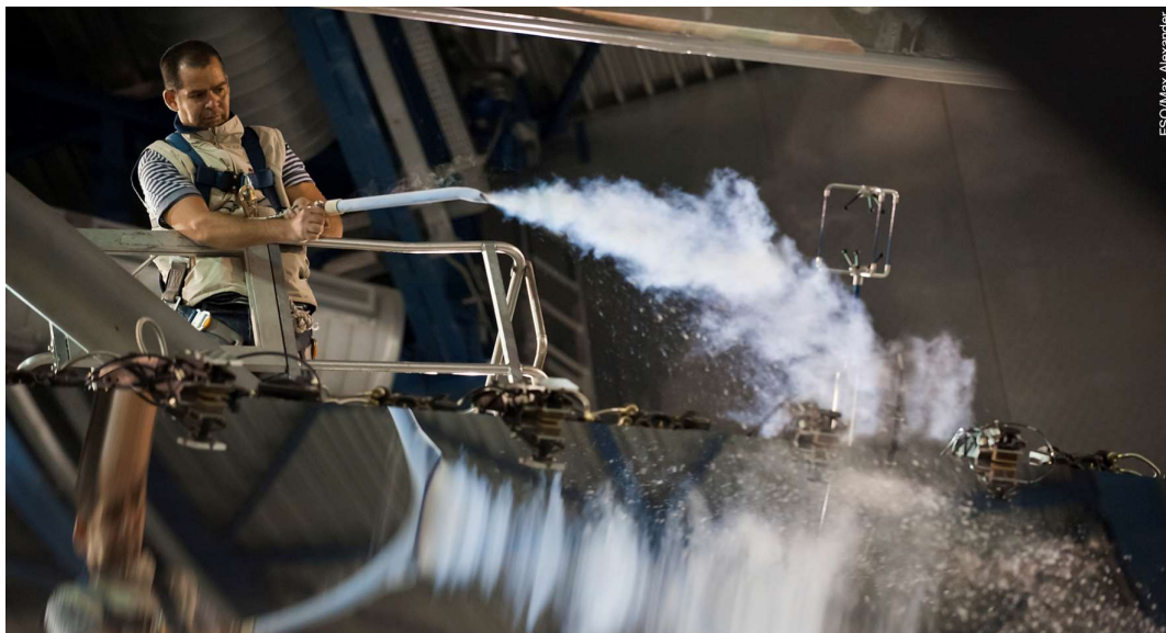
Cleaning mirrors with CO 2 .

Telescope and Instruments Operators (TIO) working full or partial night shifts receive an additional payment according to the duty station (expressed as a percentage of the basic salary). TIOs will also receive extra leave days as per table.