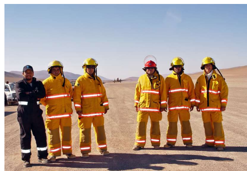
The Paranal Fire Brigade.