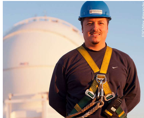
Electronic technician working on UTH/AOF.

LSM assigned to an observatory shall receive adequate working clothes and shoes, as recommended by the safety commission.