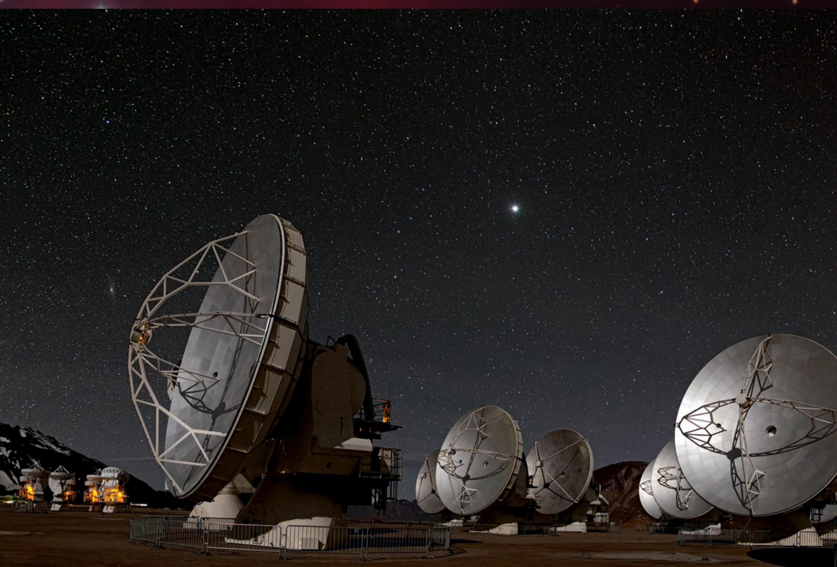
The Atacama Large Millimeter/submillimeter Array (ALMA).

A Studentship programme for PhD students lasting one to two years is also available.