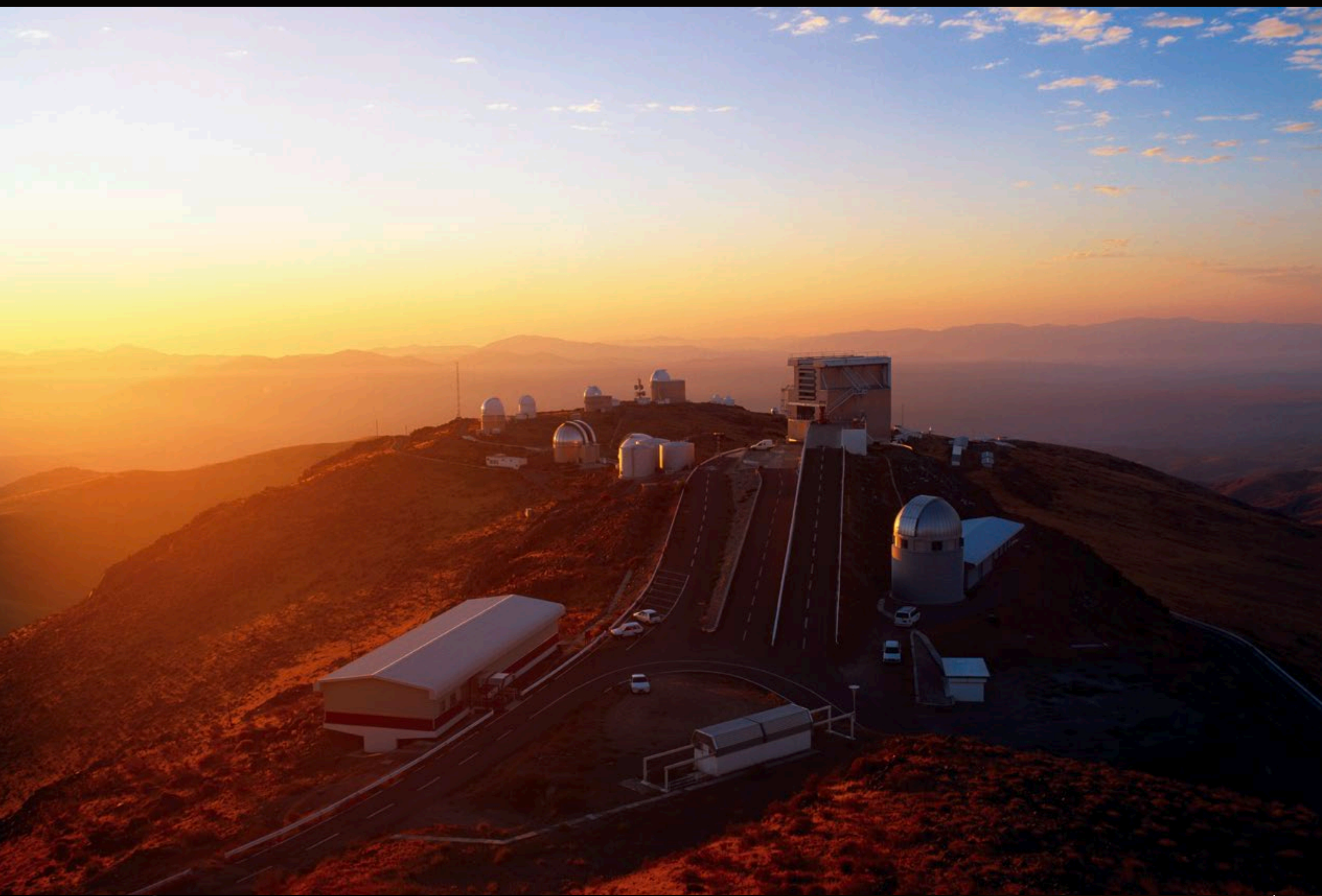
The La Silla Observatory.

On the Chajnantor Plateau, at 5000 metres above sea level, together with global partners, ESO operates the Atacama Large Millimeter/submillimeter Array (ALMA), a revolutionary astronomical telescope comprising an array of 66 giant 12-metre and 7-metre diameter antennas, which observes at millimetre and submillimetre wavelengths. On the same plateau, in another international partnership, ESO also operates the Atacama Pathfinder Experiment (APEX) telescope.