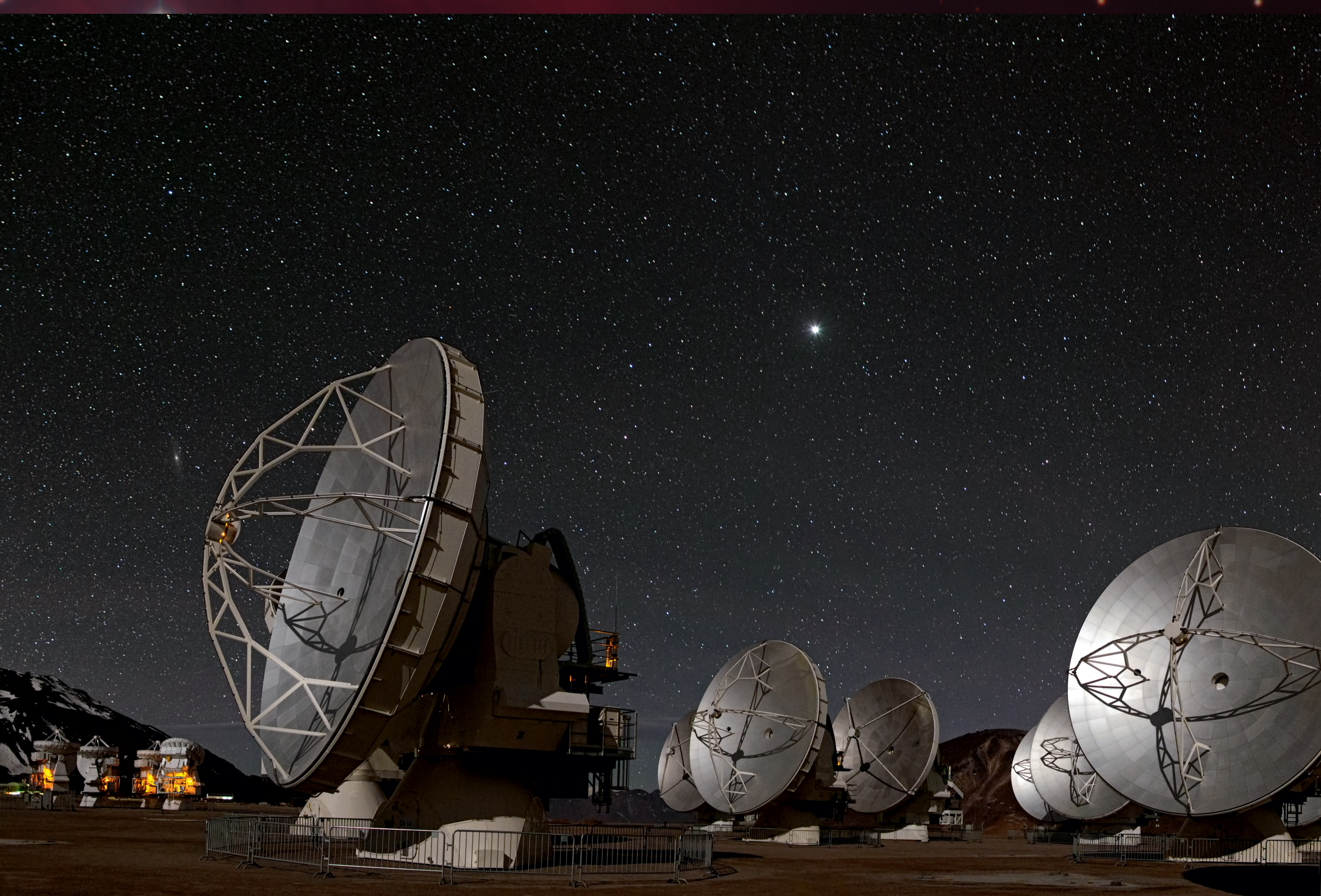
The Atacama Large Millimeter/submillimeter Array (ALMA).

A Studentship programme for PhD students lasting one to two years is also available.