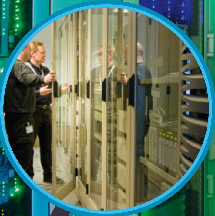
A row of servers provides access to the science data archive.

As for other astronomical archives around the world, the ESO Science Archive's legacy value is demonstrated by the increasing number of research publications that make use of it: about 130 science papers every year, independent of the purposes for which the observations were initially made.