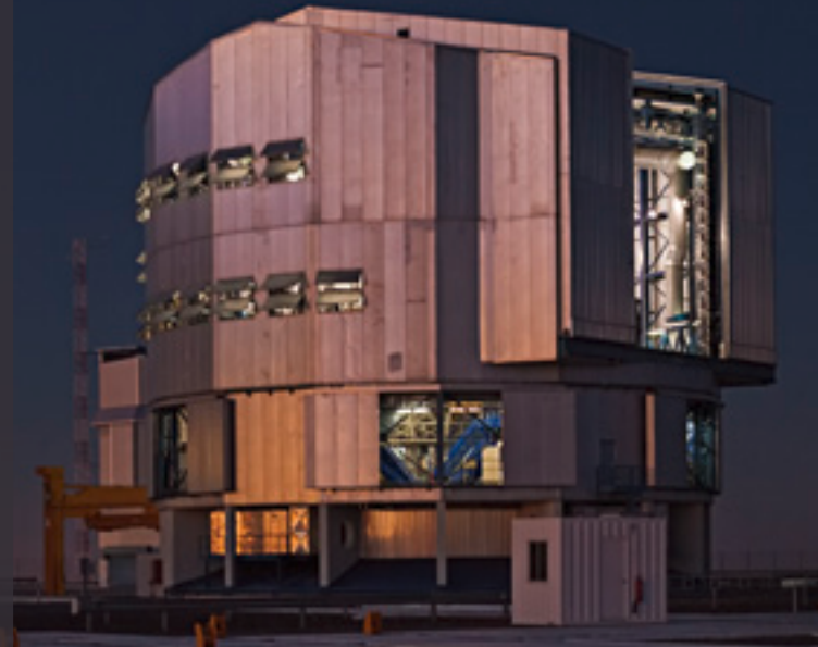
The ESO Very Large Telescope gets ready for a night of observing.

Operating a complex facility like the VLT and making sure that it is able to fulfil its enormous potential is not an easy task. Its carefully designed operations scheme, which involves specialised groups of scientists and engineers both in Chile and in Europe, is an essential component in the continued success of the VLT.